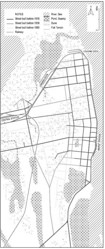
Figure 2. The development of Tourane road network on the background of natural elements (Drawn by Author).