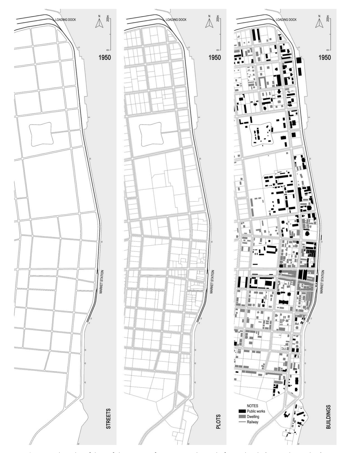
Figure 4. The urban fabric of the centre of Tourane at the end of French rule (Drawn by Author). The urban fabric illustrates the distribution of buildings (public works and dwelling) on the plots of the centre of Tourane during the colonial urban evolution. In addition, this analytical map also helps clarify the link between the sets: the network of path (streets), land divisions (plots), and constructions (buildings) (Figure 4).