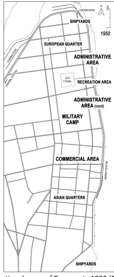
Figure 3. The functional areas of Tourane in 1950 (Drawn by Author).

Figure 2. The development of Tourane road network on the background of natural elements (Drawn by Author).